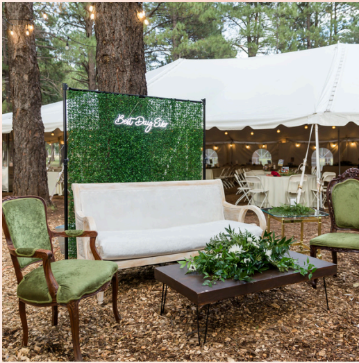
Birdsong Wedding Photography